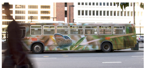
Todd Gilens Mission Blue on the 9 San Bruno Ink Jet Print 12H x 26.5W" 2011