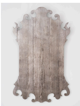
Virgil Marti Nightwatch 72H x 43W" Urethane, MDF, Plywood, and Chrome Plating 2010