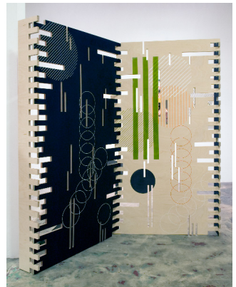
Mika Tajima Philosophers And Idlers Silkscreen, Birch plywood, mirrored aluminum 72H x 40W x 3/4D" 2008